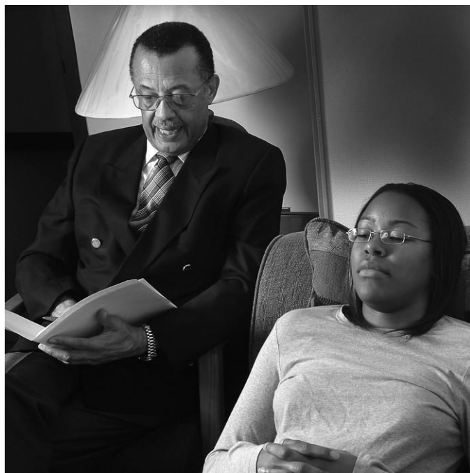
Psychologists interact with people daily, and need good communication and personal skills.

ing ways to help elderly people remain independent as long as possible.